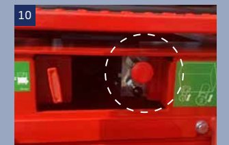
Manual release valve: When the machine can not move, you can push the machine after pressing this valve