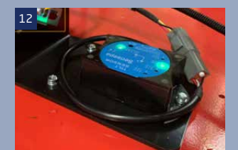
Angle sensor: when it is lifting and walking on the slope, the sensor will automatically judge the status of the machine, if the angle is larger than the rated angle, it will alarm to remind the operator.